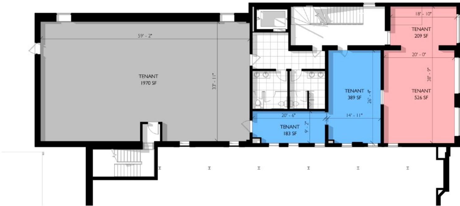
1 2 SECOND FLOOR - RENTABLE 1" = 10'-0"