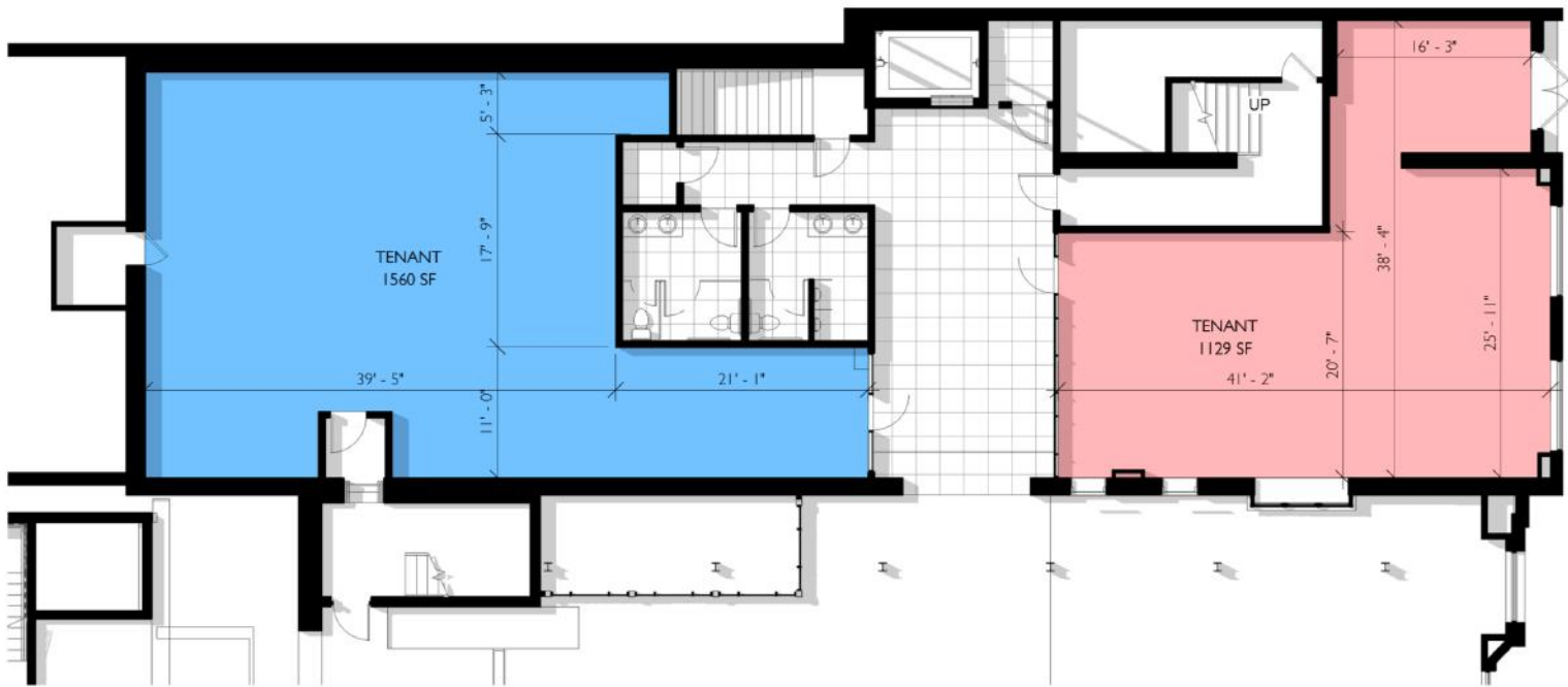
1 FIRST FLOOR PLAN 1" = 10'-0"