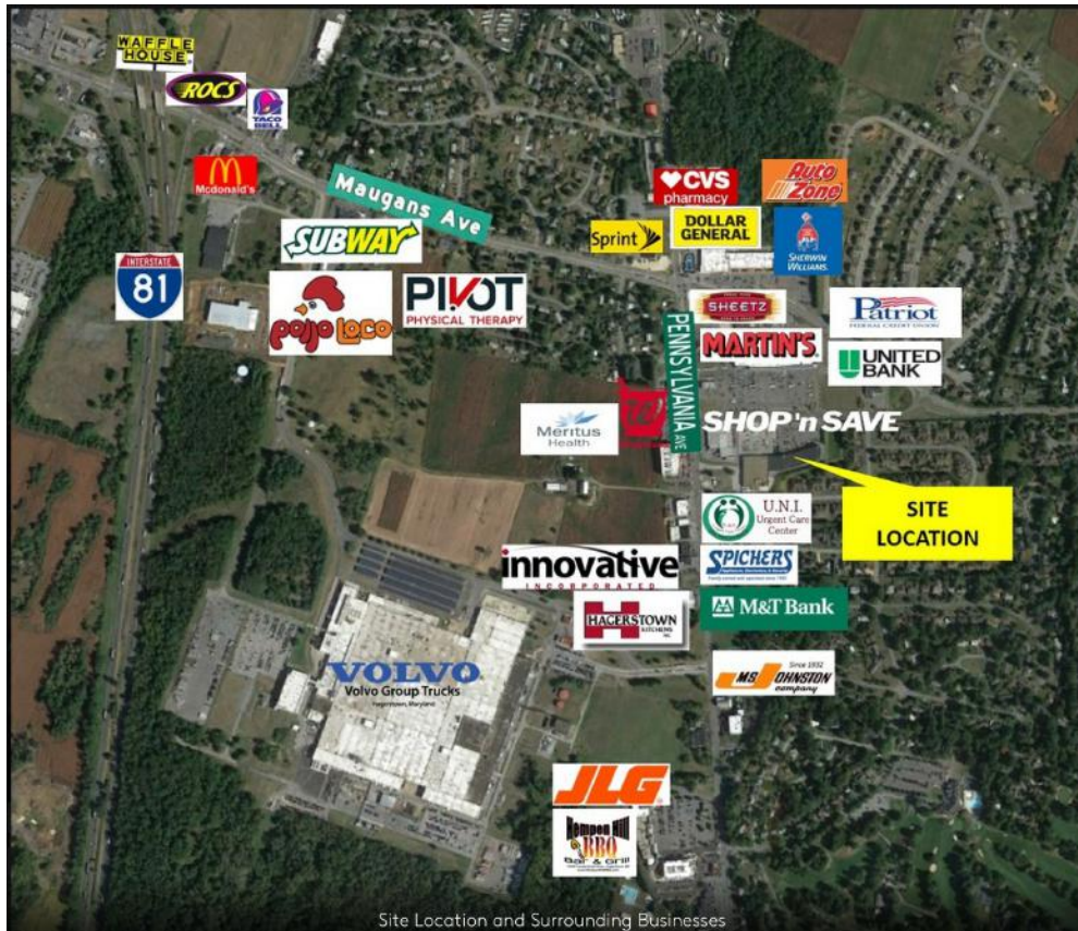
Site Location and Surrounding Businesses

18727 North Pointe Dr, Hagerstown, MD 21742