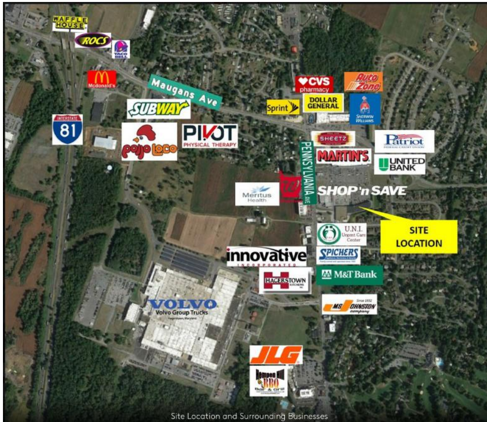
Site Location and Surrounding Businesses

18727 North Pointe Dr, Hagerstown, MD 21742